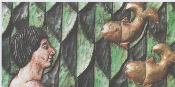
'Yellow Cedar Disc' 1994 and 'Fisherman' (detail) 1989