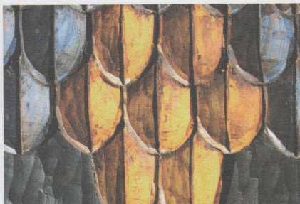
'Ram's Head Triptych' (detail) 1987, 'Grand Orchard panel' (detail) 1980 and (above) 'Planty' (detail)